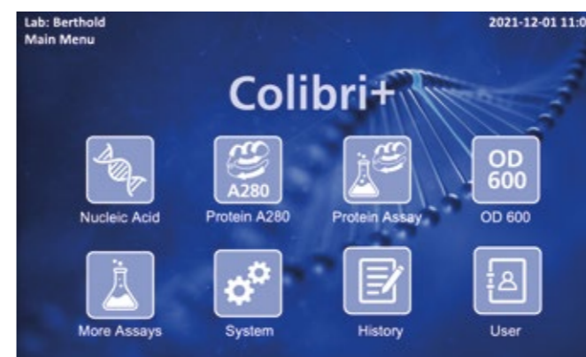
Figure 3: Intuitive touchscreen operation and a wide variety of preprogrammed protocols simplify operation of the system.