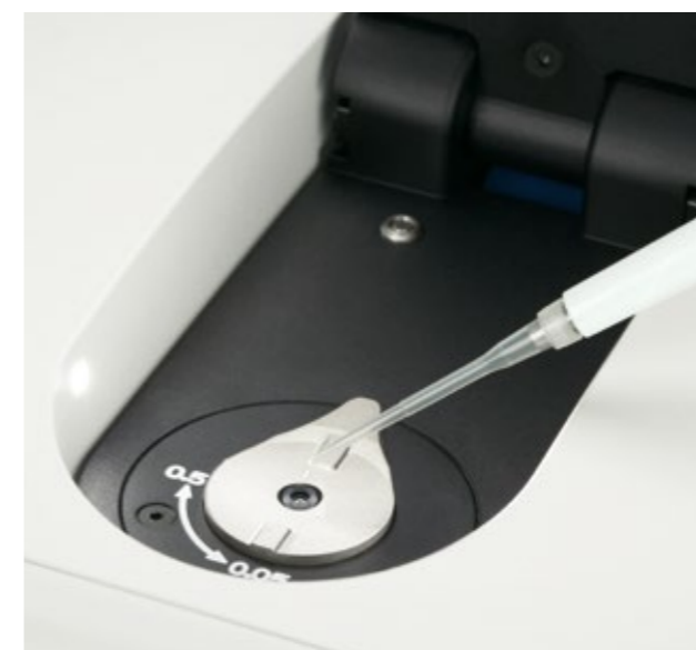
Figure 1: The Sample Guide Light enables easy sample application and helps you to detect even the smallest air bubbles. As a result, the quality of the measurement is significantly improved.