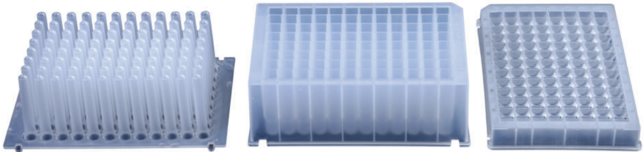
LA1097A Magnetic Tip Comb for Insta NX® MAg96