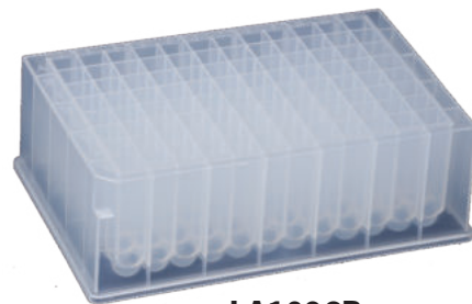
LA1096B 96 DeepWell Plate for Insta NX ® Mag32