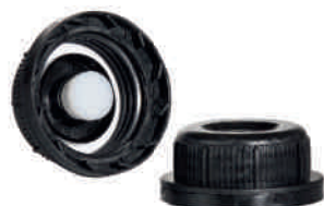
Degassing closures with tamper-evident ring