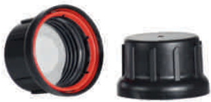
Tamper-evident closure of PP with PTFE cup gasket