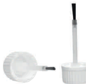
Brush closure of PP with synthetic hair