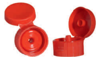
Tipping lever closure of PP with straight outlet