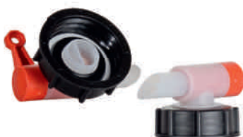
Dosage tap with closure