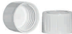
Screw closure of pressing mass with LDPE inlay