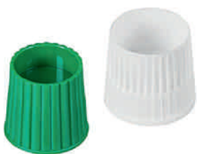
Measuring jar closures with inserted head plate