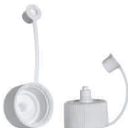
Spray closure of HD/LDPE with holding belt and cap