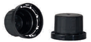
Tamper-evident closure with/without inlay