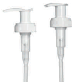
Crème dispenser with inner spring