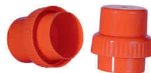
Dosage closure with inner drain as of 40 ml