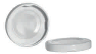
Twist-off closure for preserving jars