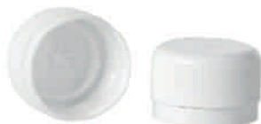
Closure for beverage bottle