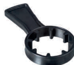
Canister key for threads of 45 - 71 mm