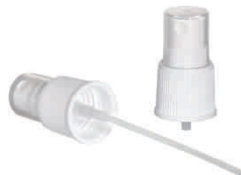
Finger sprayer with covering cap