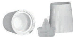
Measuring cup closure of PP with spray insert