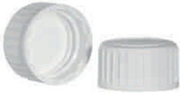
Screw closure of PP with LDPE inlay