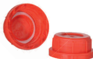
Standard canister closure