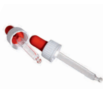
Glass drop pipette with rubber cap