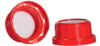
Tamper-evident closure of PP, red, with foam inlay