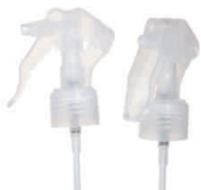
Mini Trigger of PP with safety bracket