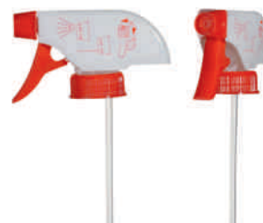
Trigger in APTP design