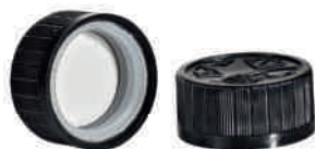
Push-and-turn closure with foam inlay