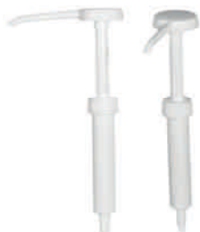
Pelican pump with variable riser length