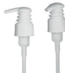
Lotion pump with bellows