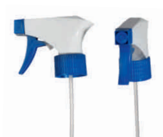
Trigger for bottles without knobs