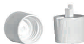
Tipping lever closure of PP with opening