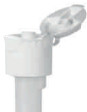
Two-chamber dosage device from 15 ml