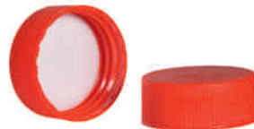
Screw closure of PP with foam insert