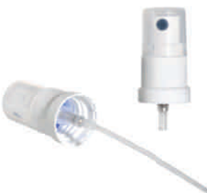
Finger sprayer with covering cap