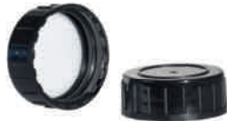
Standard screw closure of PP with different inlays