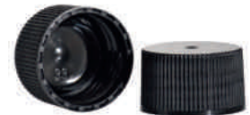
Screw closure of PP with inner cone