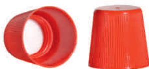
Screw closure with ALU-laminated foam inlay