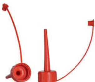
Spray closure of LDPE with holding belt and cap