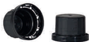
Tamper-evident closure with/without inlay